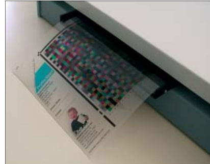
For transparent media to apply color management where images are illuminated from behind