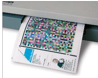
Easy to use thanks to its "no-button operation"